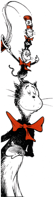
Figure 4. Mentoring Concepts in a Children's Book

"It is good I have some one To help me," he said. "Right here in my hat On the top of my head! It is good that I have her Here with me today. She helps me a lot. This is little Cat A.