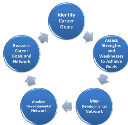
Figure 2. Identifying Career Goals and Mapping Developmental Networks