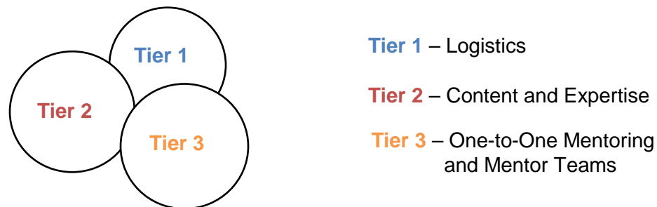
Figure 1. The Three Tiers of Resources for Mentoring

Boston Children's Hospital Office of Faculty Development (OFD) and the Department/Division and Program Chairs are committed to high quality mentoring and access to opportunities for career advising and faculty development. 1 The BCH framework includes resources, one-to-one mentoring, and the creation of mentor teams and "Developmental Networks." 2 The three tiers of OFD resources include logistical information with print and electronic media such as the OFD newsletter Perspectives and website ( www.childrenshospital.org/research/ofd ) with links to the HMS materials in Tier 1 , skills building courses and research fellowships in Tier 2 , and committed personal and professional relationships in Tier 3 .